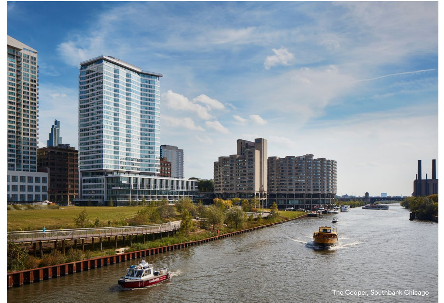
The Cooper, Southbank Chicago

Lendlease has created and built more than 50 master planned communities around the world. From urban villages in exclusive waterfront locations to large, fully planned communities with integrated town centres, our goal is to deliver the best places that offer lifestyle benefits for current residents and future generations.