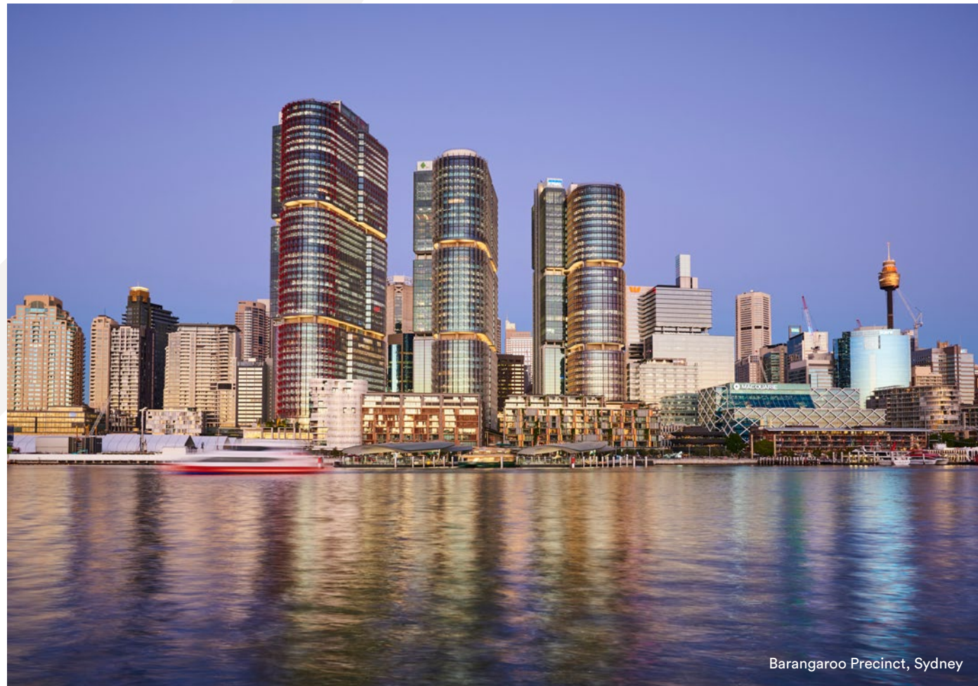
Barangaroo Precinct, Sydney

For more than 60 years, Lendlease has led the way in creating large master planned communities across Australia. Our holistic approach focuses on lifestyle and community benefits, providing a strong sense of belonging for our residents within the places we create.