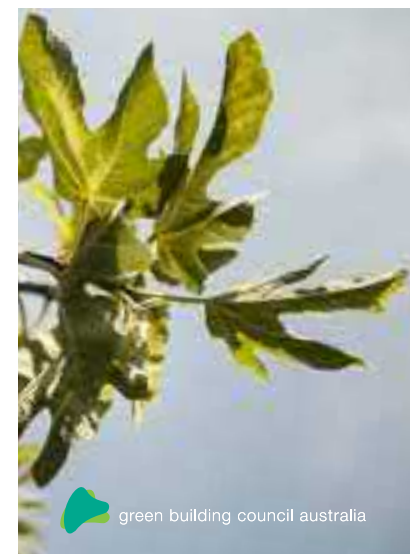
green building council australia