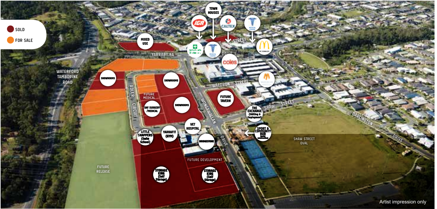
Artist impression only