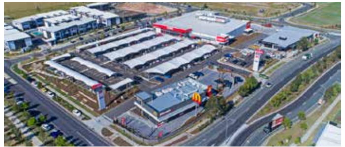
District centre now open