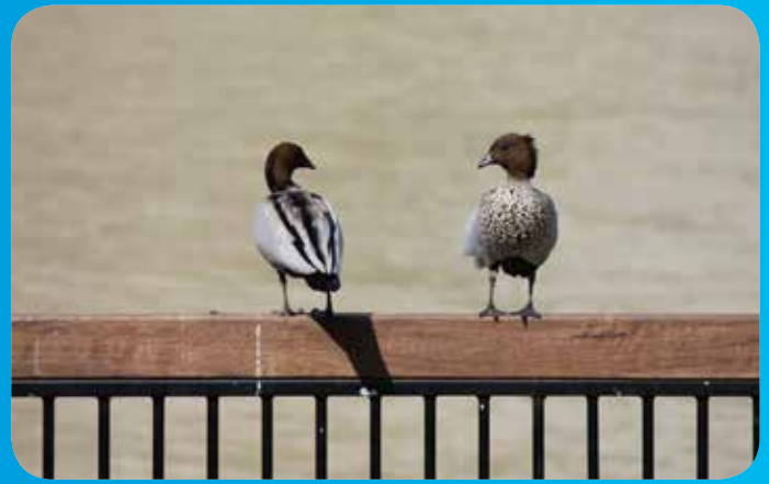
Australian Wood Ducks at Discovery Lake