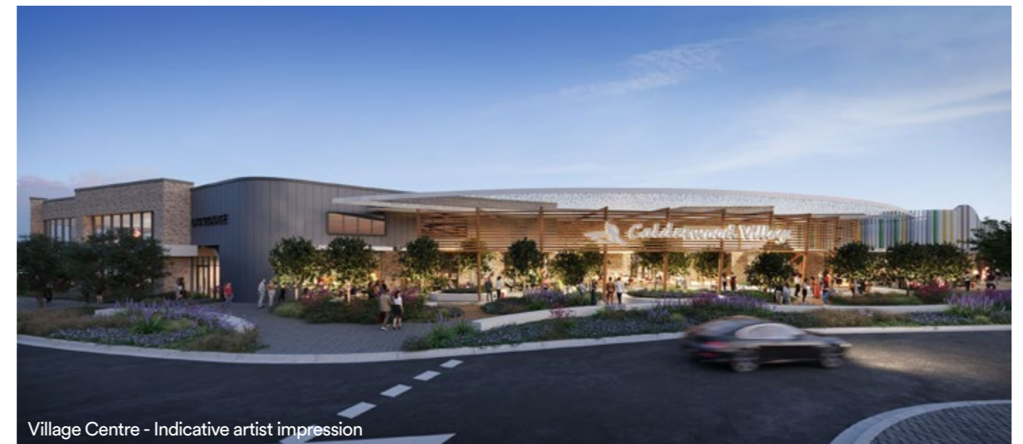
Village Centre - Indicative artist impression