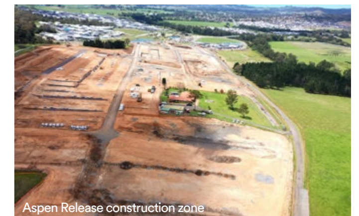
Aspen Release construction zone

Registration of lots in the Aspen Release is anticipated to occur in the second quarter of next year (subject to wet weather, authority approvals and supplies of materials).