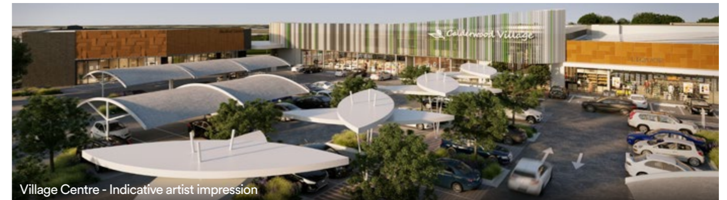
Village Centre - Indicative artist impression

We look forward to providing you with further updates as development and construction progresses.