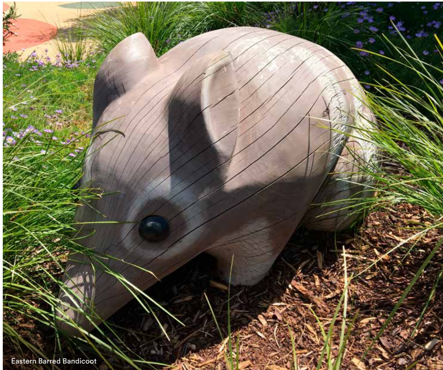
Eastern Barred Bandicoot

For Atherstone, we are already making good progress on job creation, with an estimated 2,285 jobs in construction provided so far. Over the life of the project our employment modelling tells us that Atherstone will sustain over 17,000 construction jobs and create 2,432 permanent jobs in its shops, schools, community centres and local businesses.