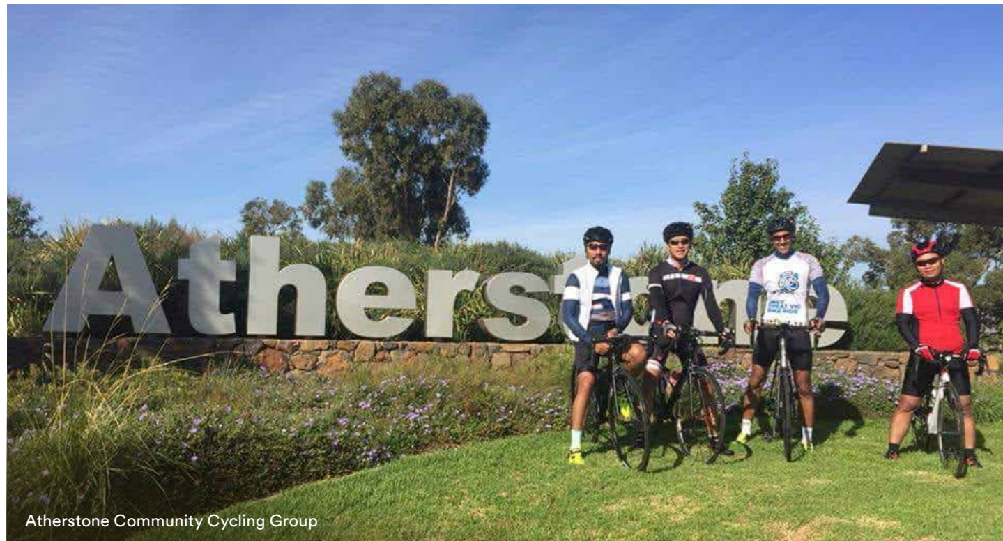
Atherstone Community Cycling Group

To get on your bike with us, look for Atherstone Community Cycling Group on Facebook.